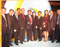
22 November YCH is Asian 3PL of the Year!