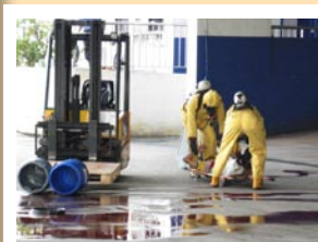
Demonstrating how to rescue casualties and cleaning up the warehouse in an unlikely event of chemical spillage