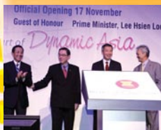
16 – 18 November YCH participates in ASEAN Business & Investment Summit