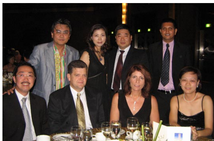
YCH management and friends enjoying themselves at the gala dinner