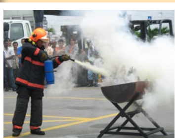
Fire fighter demonstrates how to effectively put out a fire