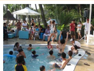
An enjoyable and relaxing day for all

Others enjoyed cooling off in Café Del Mar's Swimming Pool and Jacuzzi, while the kids were dazzled by the interesting Magic Show and Balloon sculpting sessions.