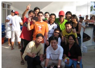
The Winning Team of the YCH Amazing Race adventure hails from ASRS

24 Nov - The much anticipated YCH Family Day took place in tranquil Sentosa, at the upbeat Café Del Mar with a hip party ambience that appealed to a diverse crowd. Despite the unpredictable weather that day, YCHees streamed into the venue with much enthusiasm and camaraderie as they looked forward to the suite of fun activities that day.