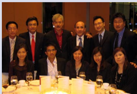
The YCH team celebrates the win at the Supply Chain Asia Logistics Awards