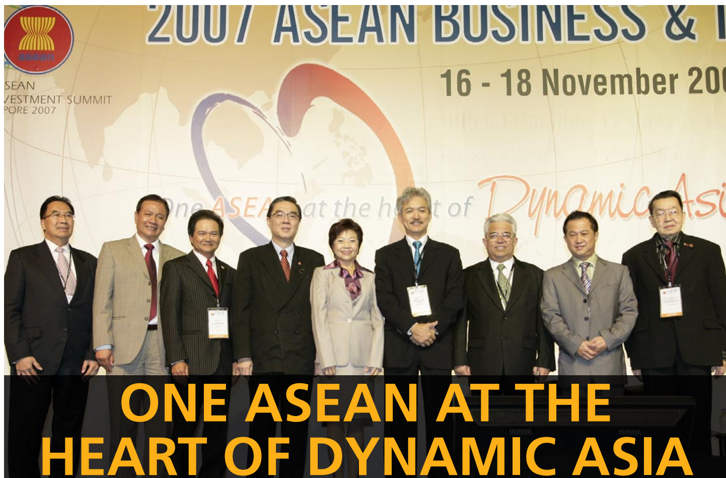
Dignitaries at the 2007 ASEAN-BIS held in conjunction with the 13 th ASEAN Summit. Singapore plays host to the ASEAN meetings this year