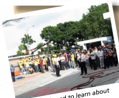
YCHees gathered to learn about EHS procedures

YCH believes that vigilance for EHS is essential within our working environment. The importance of practising good housekeeping and ensuring prevention, preparedness and response is vital towards achieving operational excellence in a stringent and secure supply chain environment.