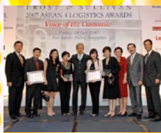
20 July Frost & Sullivan ASEAN 4 Logistics Awards: Best Domestic LSP and Best IT/Electronics LSP (Singapore)