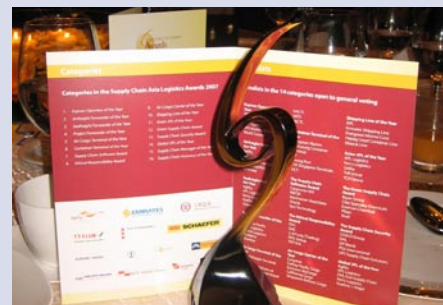
The ‘Asian 3PL of the Year’ award: A testament of our niche and expertise for supply chain excellence in Asia

YCH is honoured to be awarded the ‘Asian 3PL of the Year’ 2007. We were chosen based on a comprehensive list of criteria including the ability to understand clients’ needs; the ability to customise solutions for clients; range of specialised services on offer; size of transport and warehouse network; IT capability; level of local knowledge of developing Asian markets and cost of services. Other finalists in the category included APL Logistics, Kerry Logistics, Linfox and Toll Group.