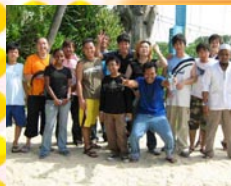
24 November Family Day: The Amazing Race