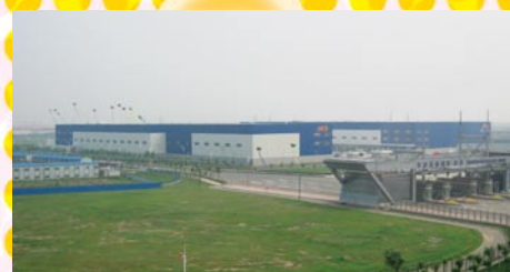
28 June Opening of state-of-the-art YCH Tianjin Airport Logistics Park