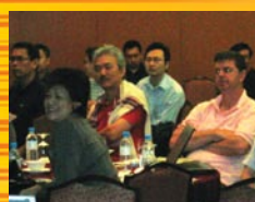
19 – 21 January Management Retreat in Kuala Lumpur