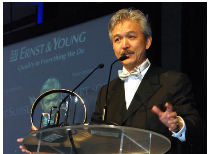
Sharing his entrepreneurial story with aspiring entrepreneurs

The Entrepreneur Of The Year Award programme is the most prominent international business award and has successfully expanded to 135 cities in more than 50 countries. First launched in 1986 in the US, the award was introduced in the Republic in 2002. Award recipients were selected based on six different criteria - Entrepreneurial Spirit, Innovation, Personal Integrity / Influence, Financial Performance, Strategic Direction and National / Global Impact - by an independent panel of judges made up of leading figures from the Singapore business community, academia and past award recipients.