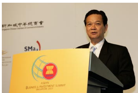
Vietnam Prime Minister Nguyen Tan Dung and Singapore Minister of Trade & Industry Mr Lim Hng Kiang spoke about growth and opportunities of their respective countries in the ASEAN context