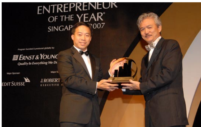
Receiving the Logistics Entrepreneur of the Year award trophy as category winner before the announcement of the Overall Entrepreneur of the Year award