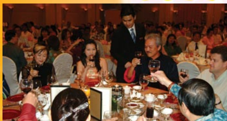
10 February Annual Dinner & Dance: China Night