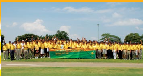
8 August 10th YCH Golf Classic @ Sentosa Tanjong Course