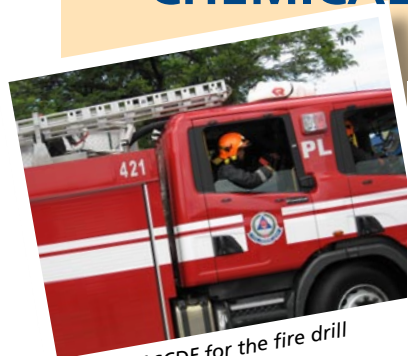
Arrival of SCDF for the fire drill exercise