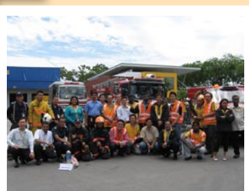
YCH Team with the SCDF Fire Fighters celebrate the success of the exercise