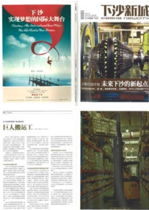
XiaSha NewCity, Aug 2007 (pg 60)

YCH has been identified as a strong regional SCM player in China by the Hangzhou XiaSha NewCity magazine. The article featured YCH's growth in tandem with one of our key customers Motorola and its manufacturing operations in Hangzhou and described our competitive strategy in providing value-added logistics services in a niche market, focusing on bringing our customers greater value and efficiency rather than simplistic cost reduction. Together with the support of the local customs and government authorities, YCH is confident of further contributing to the booming logistics and supply chain scene in the various Chinese and Asian regions.