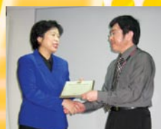
25 May Secure Trade Partnership certified by Singapore Customs