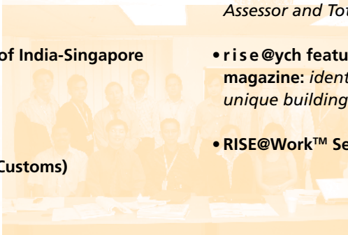
23 rd ASEAN-BAC COUNCIL MEETING Hanoi, 29 March 2007 Co-organized and Supported by ASEAN BAC VIETNAM