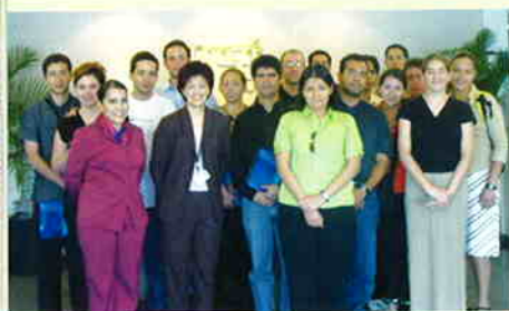
Undergraduates from ITESM

On 26th June, 2001, YCH hosted 16 bright undergraduates from the Monterrey Institute of Technology (ITESM), Mexico.