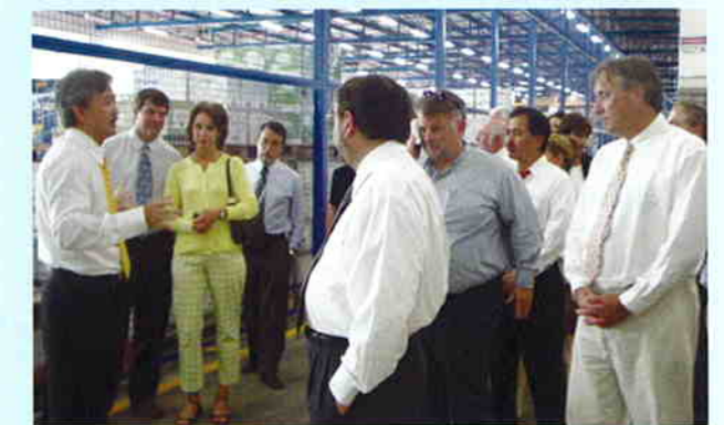
Harvard OPM 21 group having an insightful view of YCH