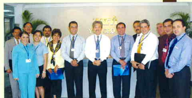
Delegation from the State of Colima, Mexico

On 21st June, 2001, a delegation of government representatives, port authorities and businessmen representatives from the State of Colima, Mexico visited YCH as part of their trade mission to Singapore. This visit further substantiates the close relationship between YCH and the Mexican authorities. The delegation also visited government organizations, Singapore port authorities, as well as other leading electronic companies.