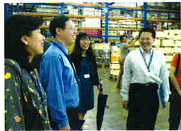
Delegates from the PSB Best Practice Network Programme

On 17th July, 2001, as part of the Singapore Productivity and Standards Board's (PSB) Best Practice Network Programme for Singapore Quality Class (SQC) organisations, YCH hosted members from Singapore General Hospital, Phillips Tuner (SQA winner, 1998) and Republic of Singapore AirForce (RSAF).