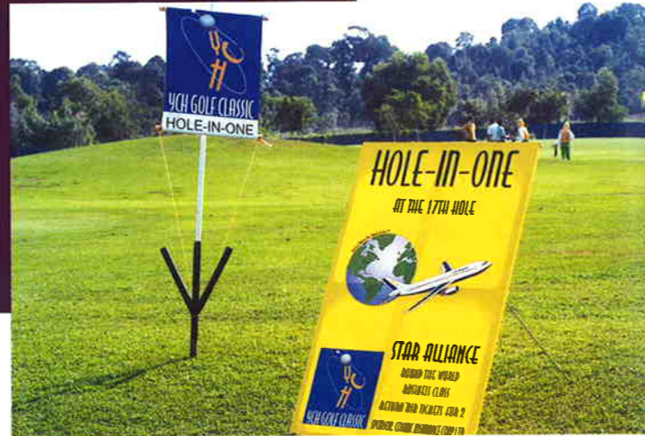
The Hole-In-One Prize - A Star Alliance Business Class Trip around the world for two

But the excitement did not stop at the greens and fairways. Everyone eagerly gathered for the lucky draw hoping to bring home those fantastic