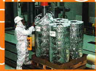
A glimpse of the processes in the Finishing Center.