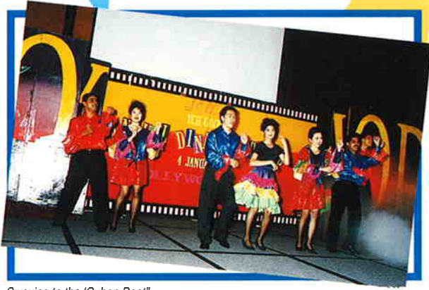
Swaying to the 'Cuban Beat'.