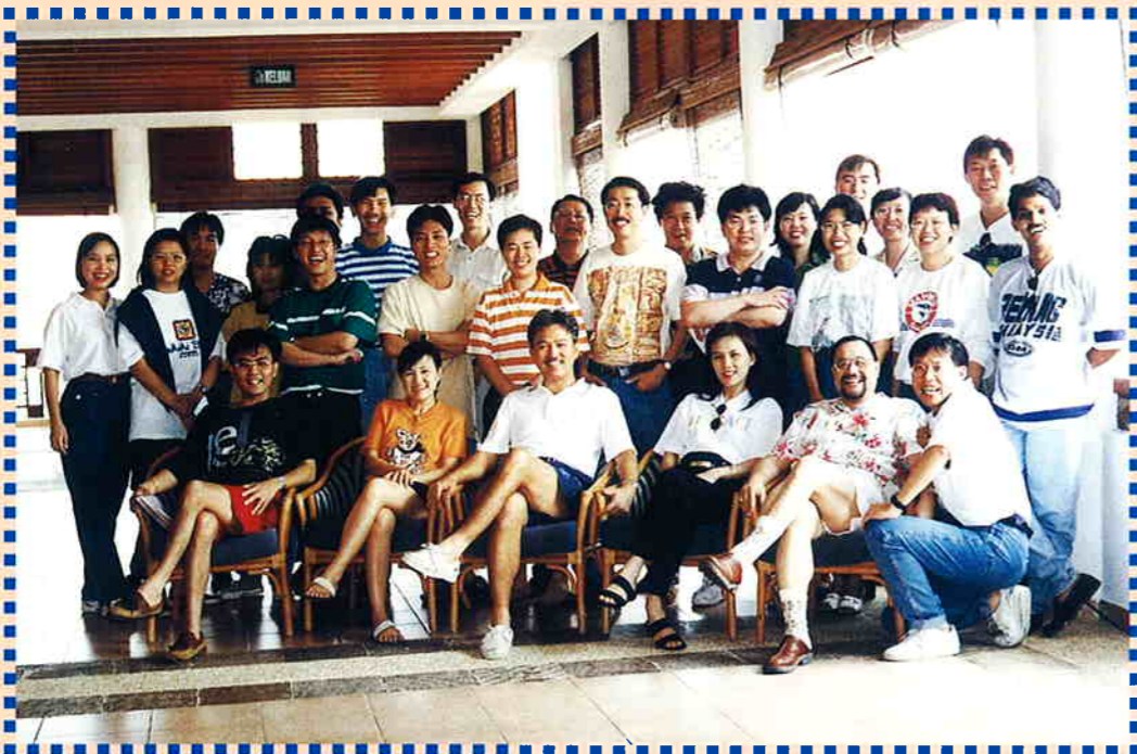
One big happy family ...

This year, a total of 29 managers and senior executives participated in the Management & Leadership Retreat from 28 to 30 March 1997. Held in Hotel Sedona Bintan Lagoon, the event focused on designing immediate tactical plans that will make the company a leading player in the integrated logistics industry.