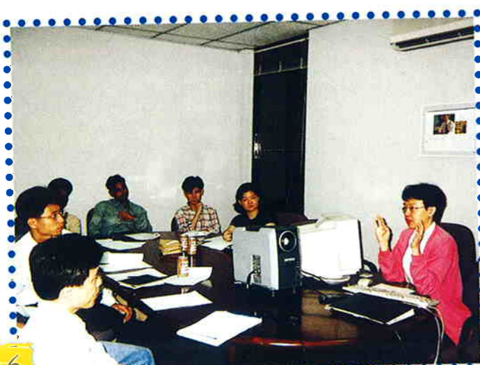
Training by our IT professional.