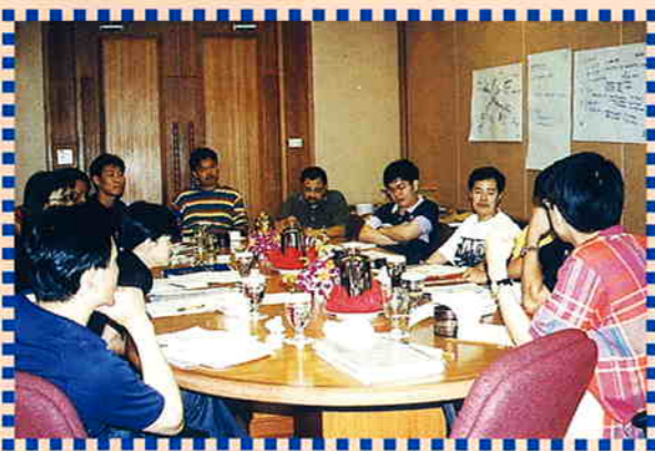
Deep in discussion ...

The highlight of the plans is the consensus to launch the YCH FUN concept, bringing enjoyment and excitement into the daily work life of every employee. The FUN concept will be spearheaded by the HR department, with every department contributing to what makes YCH a fun place to work in.