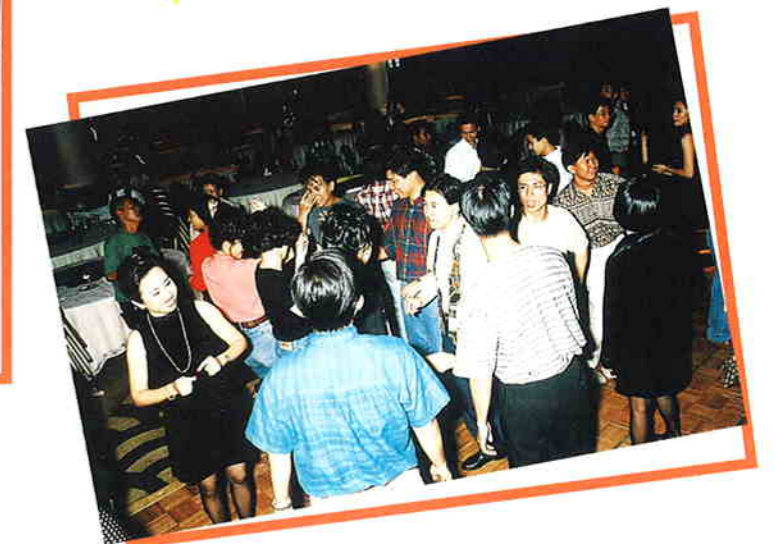
YCHees dancing the night away ....