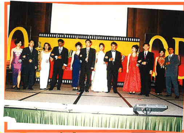
Contestants for YCH's Search for YCH Couple of the Year.