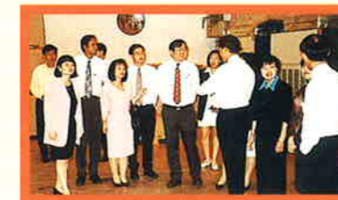
PSB team being given the grand tour.

The PSB Manpower Productivity Planning Committee paid a visit to YCH as an example of one of the local enterprises, to study the training structure in the company. Besides YCH, the other companies the team visited include Westin Hotels and McDonald's. The team was given an overview of YCH on-the-job (OJT) training structure and how YCH inculcates a learning culture into its work environment. There was laughter all around as the team members were shown how YCH implemented its "Fun" concept ~ getting staff to enjoy the challenges of working for a dynamic organisation in a fun atmosphere.