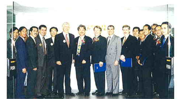
Smiles all around .....