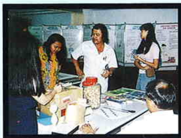
"...123, 124, 125 ... wah, so many!"

More than 150 people attended the YCH Smokefree Campaign held recently from 13-15 May 97. The campaign aimed to educate YCHees on the dangers of smoking and to encourage smokers to go "smoke-free". To promote a healthy lifestyle, apples and oranges were given to all participants. Efforts were well rewarded as about 60 smokers pledged to kick the habit.