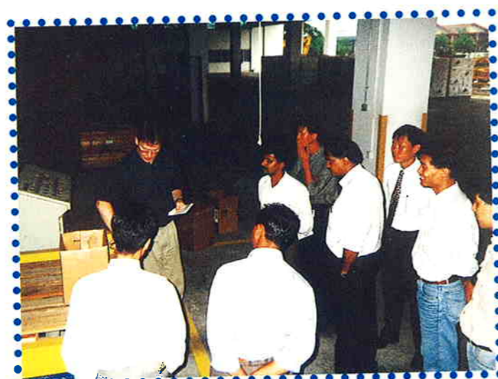
Hands-on session for all.

An intensive 1 week training was organised to ensure that both Man and Machine would be able to combine to provide the optimal logistics performance which the technology is capable of. Our Engineers, IT professionals and Logisticians were trained to be masters of the Technology. Trainers from Germany provided the insights of the system and complemented it with hands-on sessions. Often, such training would extend into the late evenings as our budding masters bombarded the trainers with questions. Case-situations were discussed and many of the "what ifs..." were posed to