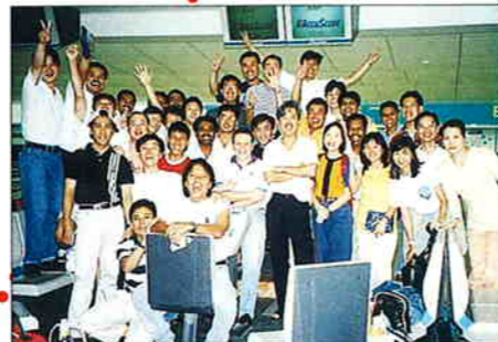
We had a Rollin' Good Time!

Register now to avoid disappointment & hope to 'sail' with you and your family.