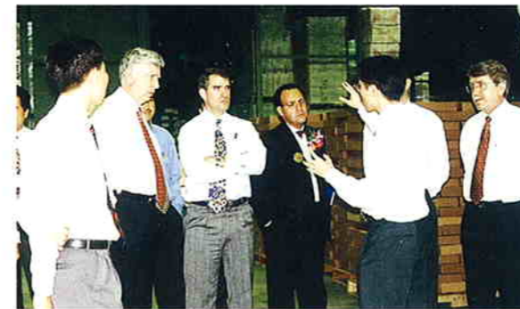
YCH's operations being explained to the Warner Lambert Schick team.