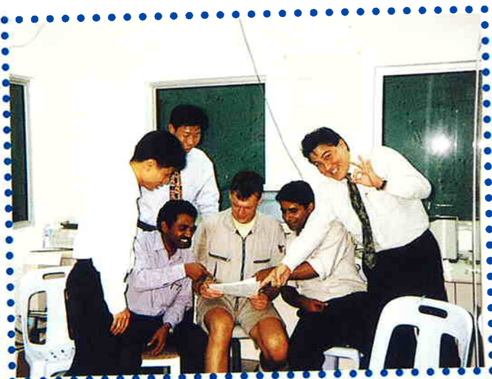
"German? Understand everything said."

A session was then arranged for the users to be trained to handle the features of the systems. Having gone through the various training sessions, the ASRS team are now bursting with confidence and all eager to exploit the capabilities of a fully automated system to serve our customers with nothing but the best.