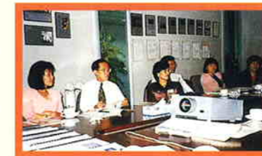
Members of PSB Manpower Productivity team.