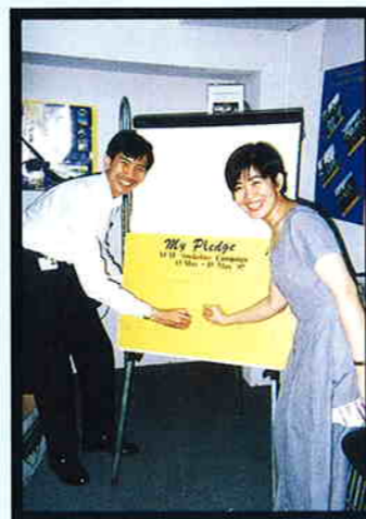
No more "butts" for us!