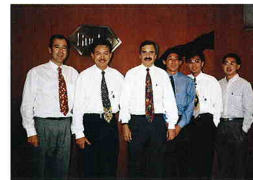
The YCH/Roche team at the stocktake announcement