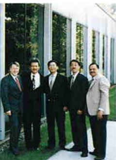
Visit to SCHICK's headquarters in Connecticut, USA.