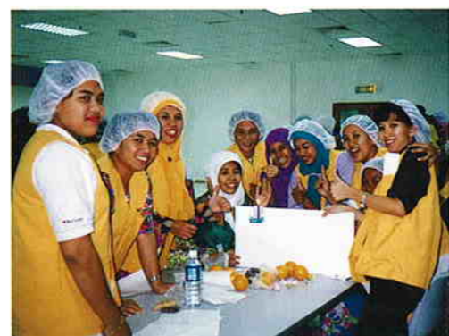
'Boleh!' - Ladies from SCHICK during a teambuilding session

The various section heads pointed out that good teamwork is the key factor in the successful set-up of the plant operation. Working closely together, they know that they can rise above the challenges to meet customers' requirements in spite of obstacles along the way and long hours of hard work. Well, we wish these guys our very best and hope to hear more about their successes in the next issue!!