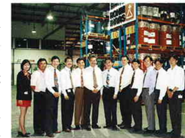
To a great partnership!

As a total logistics partner of Rohm and Haas in Singapore, YCH manages the full spectrum of logistics services including all inbound and outbound cargoes, inventory management and control with complete shipping documentation services through the latest integrated IT systems.