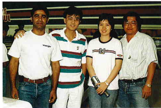
Ace bowlers in the making . . .