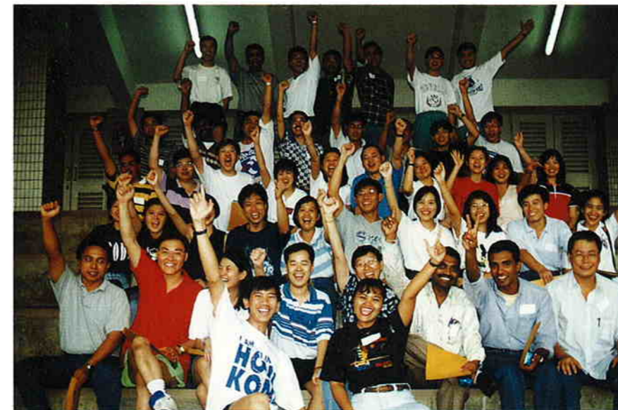
Ready for the world