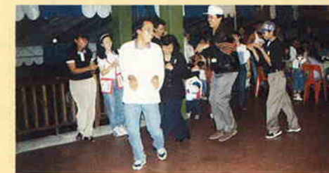
The Malaysian Kanga-Gurus