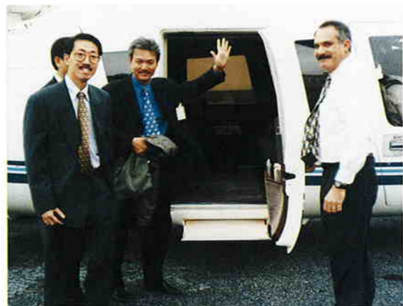
The YCH team boarding Warner Lambert's private jet to visit their distribution centre in Philadelphia.