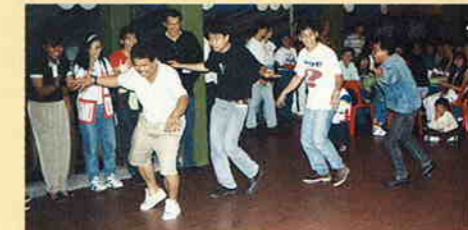
The Singapore Quack