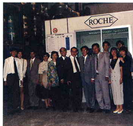
Vietnam Ministry of Health

A behind-the-scenes tour of the logistics operations proved to be an eye-opener for the delegates. They gained a fuller appreciation of the multiple process behind the export of vitamins and diagnostics products that goes to Vietnam each year.