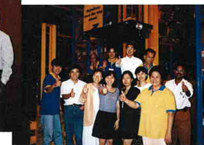
Well done folks! We are proud of you!!

A perfect 100% inventory accuracy! Yes!! A commendable achievement indeed for the ROCHE team. This year's stocktake involves more SKUs (stock keeping units) than in 1995 as we are reconciling by lot numbers and not just product line items. "In my entire